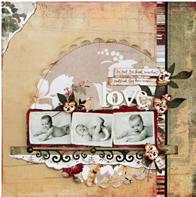
love/ 12"x12", three 2½"x2" B&W horizontal photos